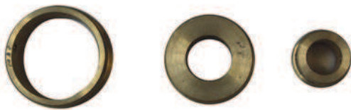
Fig. 7: Conductor rings

Note: Please attend the necessary thread size of the conductor ring according to the selected slide-on cone.