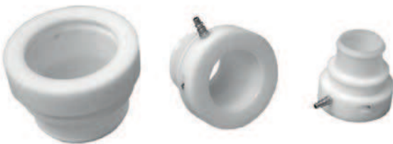
Fig. 5: Slide-on rings with gas valve

D_{sc} = Diameter over outer semi conductive layer of the cable