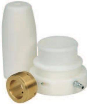
Fig. 4: Single slide-on components

The slide-on components are required for the installation of the joint body dependent on the particular cable dimensions. For proper installation four slide-on components are required, one slide-on ring with gas valve, two slide-on cones and one conductor ring.