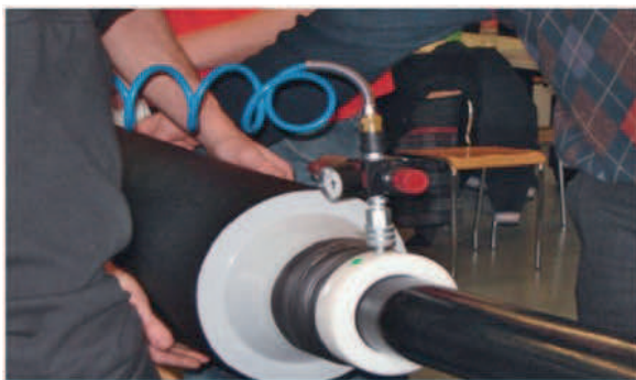
Fig. 1: installation with gas cushion method

The following application guide will help you easily select the necessary tool components for single applications according to the particular cable dimensional data. Complete tool sets to cover a wide range of cable dimensions and voltages are also available; please consult the Brugg Cables e-Catalogue.