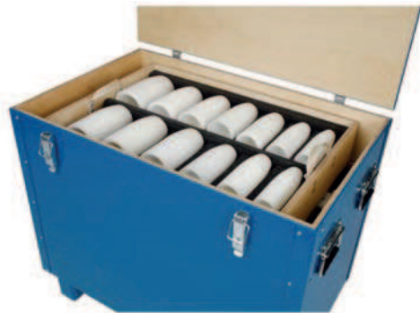
Fig. 8: Complete set in a robust wooden box

Complete sets are offered to simplify the selection of slide-on components. These sets contain, for defined cable dimensions, a basic assembly tool set plus all the single components required for a proper installation.