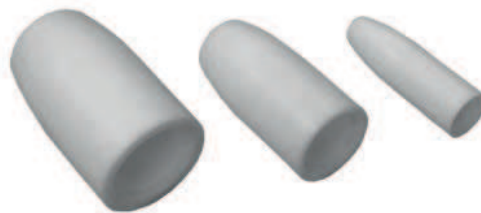
Fig. 6: Slide-on cones

D_{\text{insul}} = Diameter over cable insulation