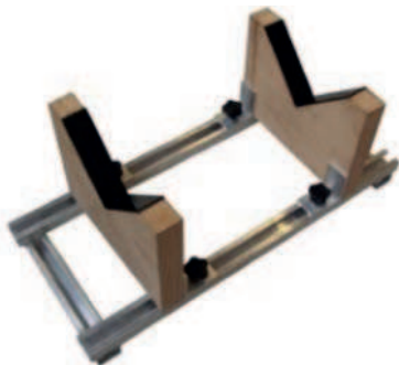
Fig. 2: Carrier for silicone joint bodies

The carrier is used to safely deposit joint bodies during the set-up process.